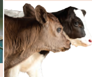
dairy & beef calves