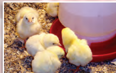
Young Animal Diets