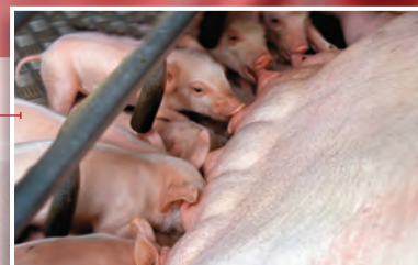
Lactation & Gestation Diets