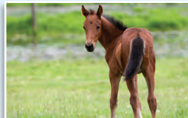
Early Life Nutrition