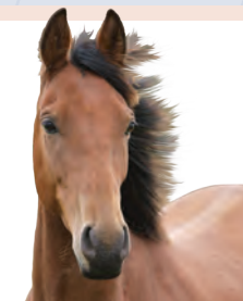
companion animals: dog, cat & equine