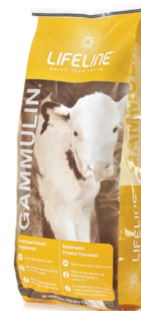
LIFELINE Gammulin® Functional Protein Supplement