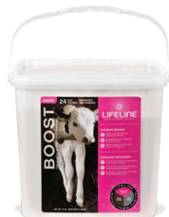
LIFELINE Boost™ Colostrum Booster