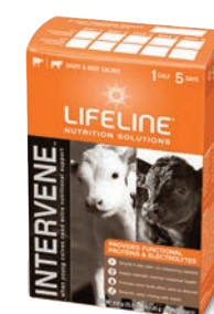
LIFELINE Intervene™ Nutritional Supplement

Provide your calves with the extra nutritional support they need.