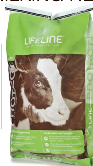
LIFELINE Protect™ Dairy Colostrum Supplement